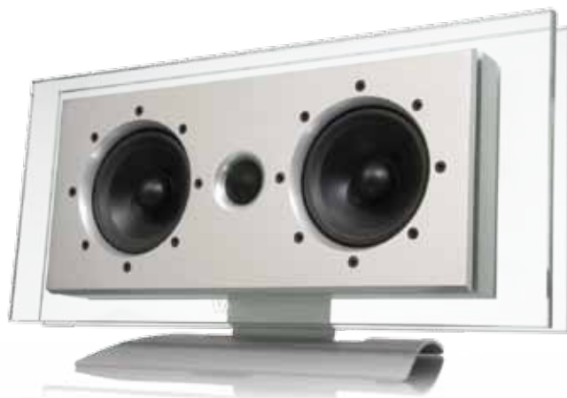
Elora center on shelf stand (optional)