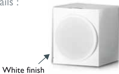
Atohm LD230 Driver (absolute series)